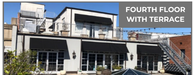
FOURTH FLOOR WITH TERRACE